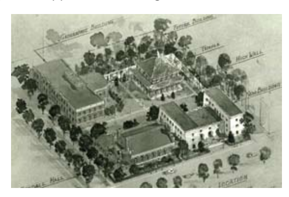
Proposed location and scheme, Golden Temple and Institute, Divinity Avenue and Kirkland Street, Cambridge, MA, Stanley B. Parker, 1950

region along the Volga River between the fourteenth and sixteenth centuries. Qianlong's decision to construct the Lama Temple at Chengde in celebration of his 60th and his mother's 80th birthdays coincided with the return of the tribe to China in 1771, establishing a unique connection between the tribe and the temple.