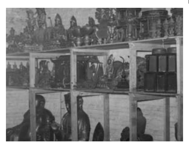
A selection of objects from the Golden Temple, Cambridge, MA, date unknown.

could be held within the building, and efforts could also be coordinated with Harvard's Fogg Museum to create exhibition space within the Temple to display its rich collection of Buddhist material. This was comprised of over 175 objects of religious and cultural significance, including a Ming dynasty temple bell and incense burner, numerous bronze and wooden Buddha figures, several Tankas, precious Lama robes, model stupas and pagodas containing