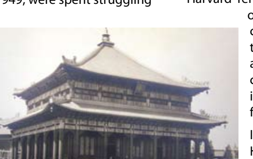
Lama Temple, 1933 "Century of Progress", World's Fair, Chicago

Oberlin College owned the rights to the temple, which was originally commissioned by the Chicago businessman Vincent Bendix in anticipation of the Chicago World's Fair in 1933 (Figure 1). In 1930, the Swedish geographer Sven Hedin discovered the pavilion on a Bendix-sponsored exploratory mission to northern China and Mongolia, and he promptly ordered a piece-by-piece reconstruction to be designed by the Chinese architect Liang Weihua, erected in Beijing, disassembled, and rebuilt on the grounds