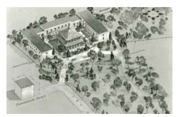
Proposed location and scheme, Golden Temple and Institute, Beacon and Irving Streets, Cambridge, MA, Stanley B. Parker, 1950

little about the Asian population is just as dangerous as a lack of scientific knowledge." Today, a rich diversity of departments, programs, and institutes make Harvard one of the premier destinations for scholars of East Asia.