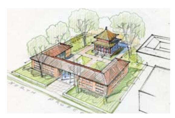
Proposed location and scheme, Golden Temple and research center, Oberlin College, Oberlin, OH, Eldridge Snyder, date unknown

its reconstruction in Cambridge as the potential nucleus of a future center of Far Eastern studies at Harvard under the Institute's auspices. The construction of several new buildings highlighted by the temple, including new classroom space, office research facilities, and an Asian